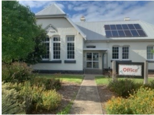
Windows and entry way refreshed.