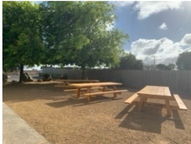
The site of our outdoor classroom. (Shade sail to come over the tables) Tables & Chairs expertly made by 2021 HOL team.